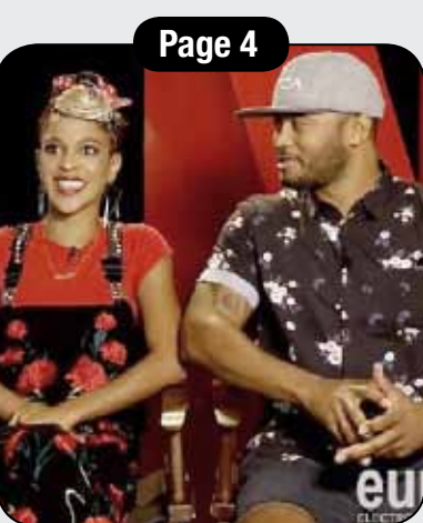
CCN on the Scene to Step to the 'Step Sisters' Cast