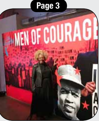
It's 'Pick of the Vine' season at Little Fish Theater in San Pedro