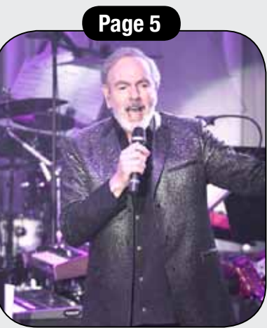
Neil Diamond announces retirement from touring, Parkinson's diagnosis